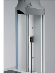
Gigabit LAN x1