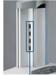
USB 3.0 x 4